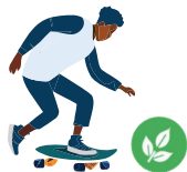
Stay active. More green time, less screen time