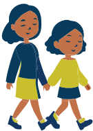
Screen-free time together