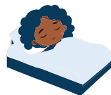
No screens at least 1 hour before bedtime